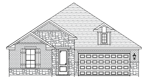
ELEVATION A (WITH STONE)