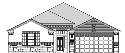
ELEVATION A (with stone option)