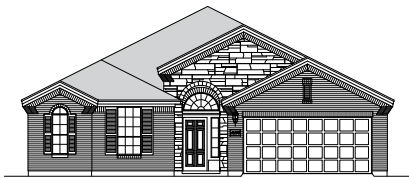
ELEVATION C (with stone option)