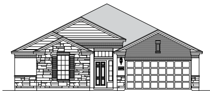
ELEVATION B (with stone option)