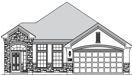
ELEVATION A (with stone option)