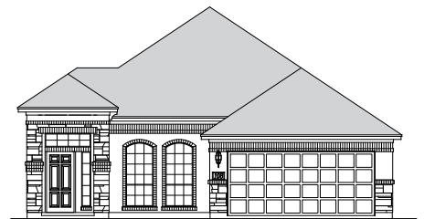
ELEVATION B UPGRADE (with stone option)