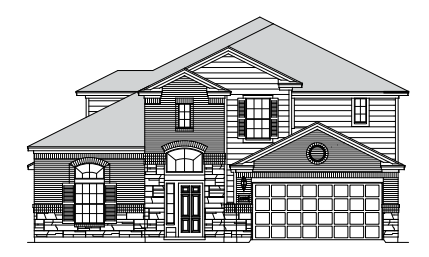
ELEVATION B (with stone option)