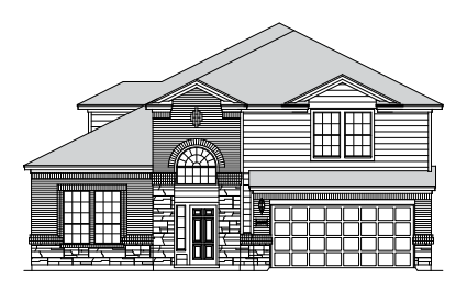
ELEVATION A (with stone option)