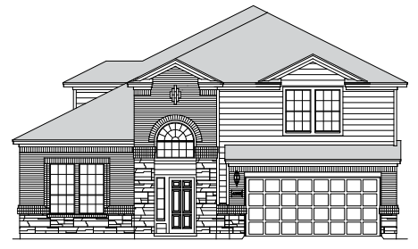
ELEVATION A (with stone)