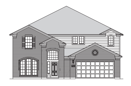
ELEVATION B (with bedroom 6 option)