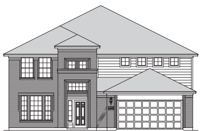
ELEVATION A (with bedroom 6 option)