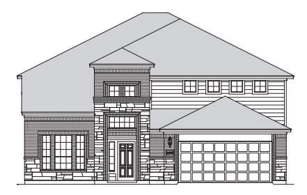
ELEVATION A (with stone)