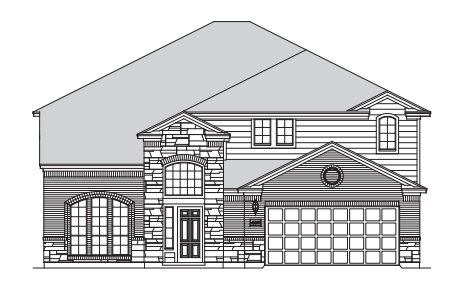
ELEVATION B (with stone)